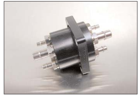
Our captured o-ring design provides a superior seal ensuring a leak resistant fitting

Static Bulkhead Connector with four stations a 1-1/2" Body and 1/4 Push-in Fittings